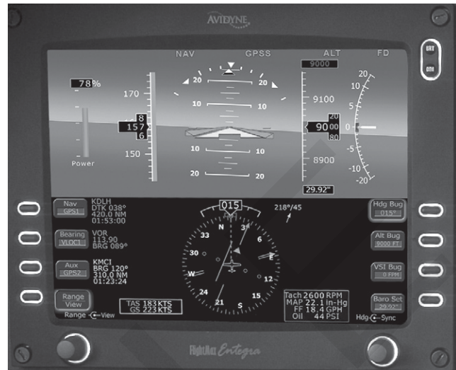
Figure 2-2. A typical primary flight display (PFD)

Electronic flight instrument systems integrate many individual instruments into a single presentation called a primary flight display (PFD). Flight instrument presentations on a PFD differ from conventional instrumentation not only in format, but sometimes in location as well. For example, the attitude indicator on the PFD is often larger than conventional round-dial presentations of an artificial horizon. Airspeed and altitude indications are presented on vertical tape displays that appear on the left and right sides of the primary flight display. The vertical speed indicator is depicted using conventional analog presentation. Turn coordination is shown using a segmented triangle near the top of the attitude indicator. The rate-of-turn indicator appears as a curved line display at the top of the heading/navigation instrument in the lower half of the PFD.