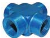
AN918 CROSS INTERNAL PIPE THREAD NEW SURPLUS