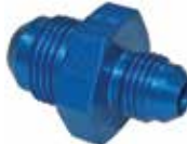
AN919 REDUCER, EXTERNAL THREAD